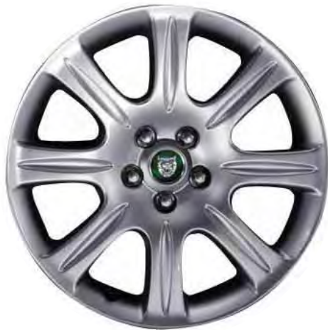
DYNAMIC 8" X 18" C2C 17295