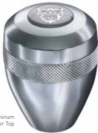
Brush Aluminum With Growler Top