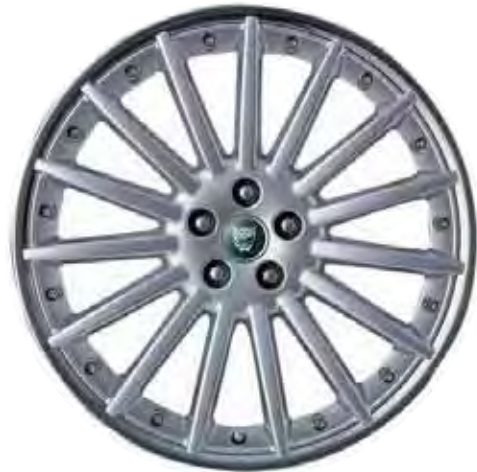
SEPANG 9" x 20" C2C 18597