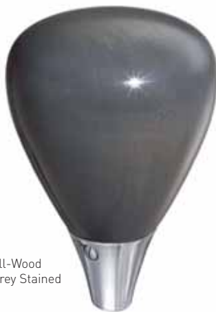
All-Wood Grey Stained