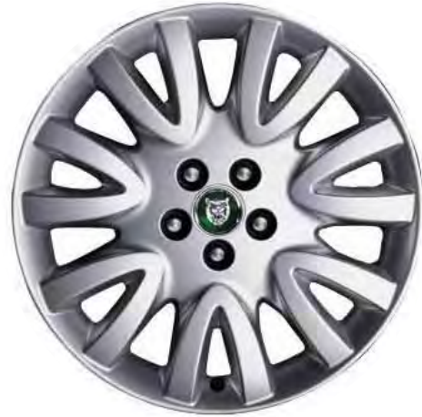
LUXURY 8" x 18" C2C 17293

ACCENTUATE YOUR XJ'S STUNNING APPEARANCE WITH JAGUAR-APPROVED ALLOY WHEELS. Engineered to the same high standards as your vehicle's regular wheels, they add a sporty touch to your XJ's distinguished look.