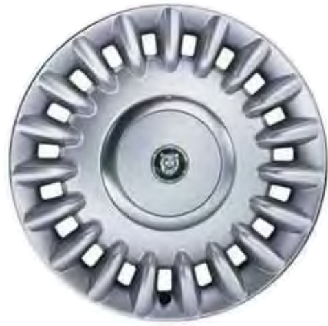
PRESTIGE 18" C2C 17294