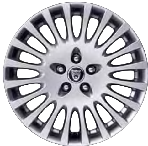
RAPIER 18" C2C 32497