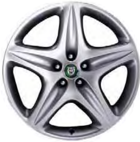
CUSTOM 8.5" X 19" C2C 17297